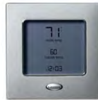
Performance™ Series Programmable Thermostat Models TP-PRH, TP-PHP, TP-PAC