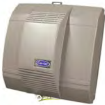
Performance™ Series Humidifiers