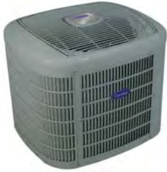
Infinity® 19 Heat Pump Model 25HNA9