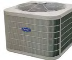
Comfort™ 16 Air Conditioner Model 24ACC6