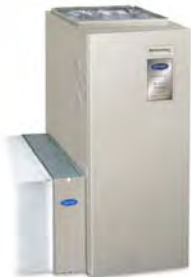
Infinity® ICS Gas Furnace Model 58MVC