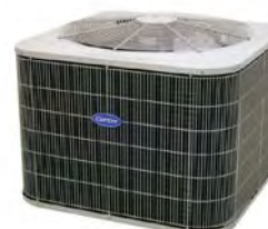
Model 24ABC6 Air Conditioner