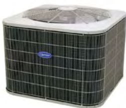
Model 25HBC5 Heat Pump