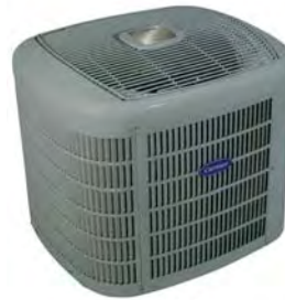
Infinity® 21 Air Conditioner Model 24ANA1