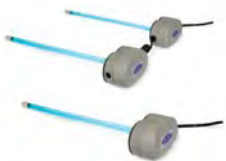
Performance™ Series UV Lights