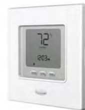
Comfort™ Series Programmable Thermostat Models TC-PHP, TC-PAC