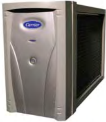
Infinity® Air Purifier Model GAPAA