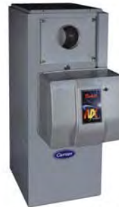
Performance™ 80 Oil Furnace Model OVM