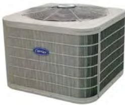
Comfort™ 15 Heat Pump Model 25HCC5