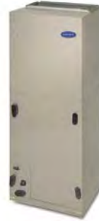
Infinity® Series FE Fan Coil