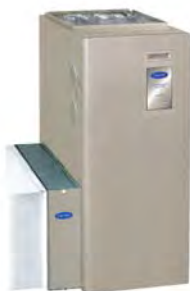
Performance™ Boost 90 Gas Furnace Model 58MEC