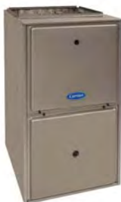
Comfort™ 95 Gas Furnace Model 58HDX