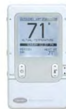
Infinity® Zone Control